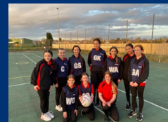
Year 7 B team – Nuneaton – 5th place