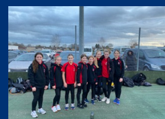
Year 7 A team – Nuneaton tournament winners