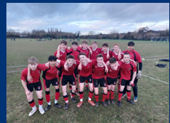
Year 11 football team